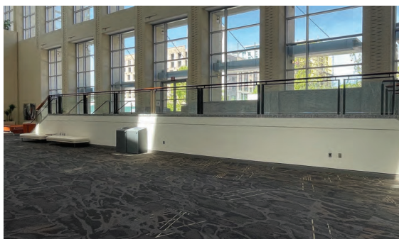
MEZZANINE LOWER LANDING

With several levels of glass railings throughout the concourse, the Raleigh Convention Center is the perfect location to highlight your brand and stand out.