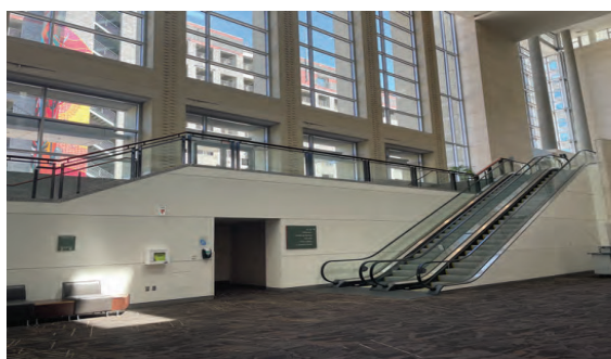
MEZZANINE UPPER LANDING