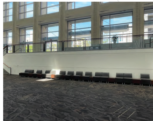
MEZZANINE MIDDLE LANDING